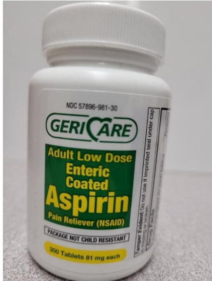
Recalled Geri-Care Brand Adult Low Dose Enteric Coated Aspirin 81mg tablets 300-count bottle