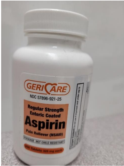
Recalled Geri-Care Brand Regular Strength Enteric Coated Aspirin 325mg tablets 250-count bottle