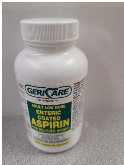
Recalled Geri-Care Brand Adult Low Dose Enteric Coated Aspirin 81mg tablets 1,000-count bottle